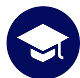
Table of Content