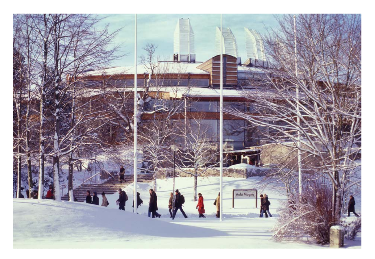
We look forward to a continued fruitful cooperation and to welcoming your students here in Stockholm in 2023/2024!