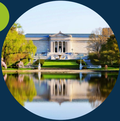
Cleveland Museum of Art