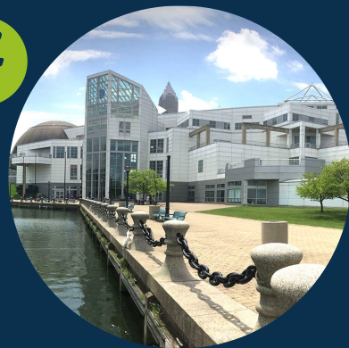
Great Lakes Science Center