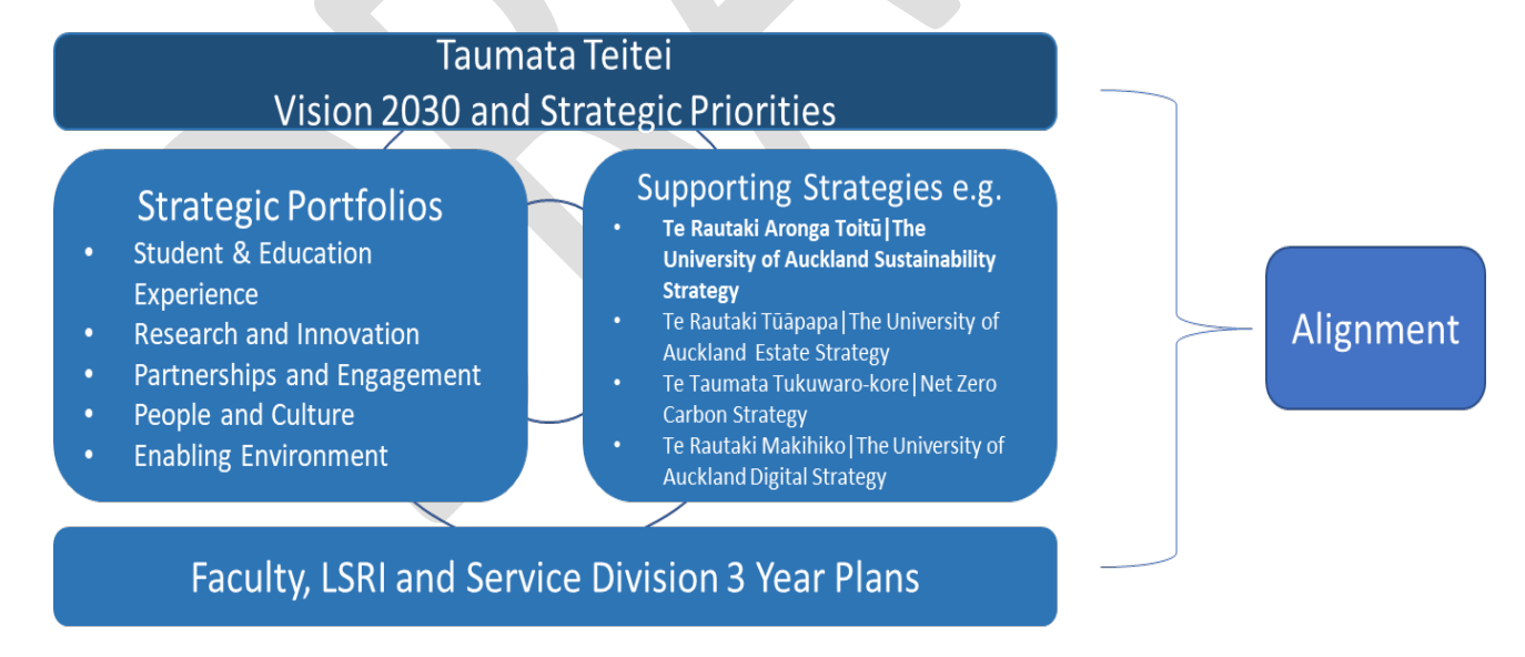
Figure 1. Strategic alignment of Taumata Teitei portfolios and strategies

This commitment to sustainability is reflected across the University strategic portfolios and supporting strategies, especially Te Taumata Tukuwaro-kore | Net Zero Carbon Strategy, the Curriculum Framework Transformation Programme including the graduate profile, and implementation of Te Rautaki Tūāpapa | The University's Estate Strategy 2021 – 2030 and Te Rautaki Makihiko | The University of Auckland Digital Strategy 2025 (see Figure 1).