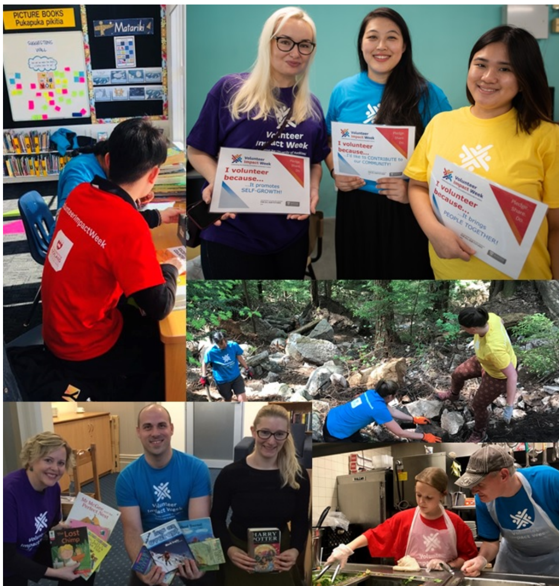
Projects from Volunteer Impact Week 2019

Thanks for your interest in Volunteer Impact Week and joining our mission to change the world. We gathered some information to help you plan your volunteering activity and spread the word if you're so inclined. Giving the gift of time is an amazing way to be a part of the change you want to see – and a gift that continues to pay personal and collective dividends.