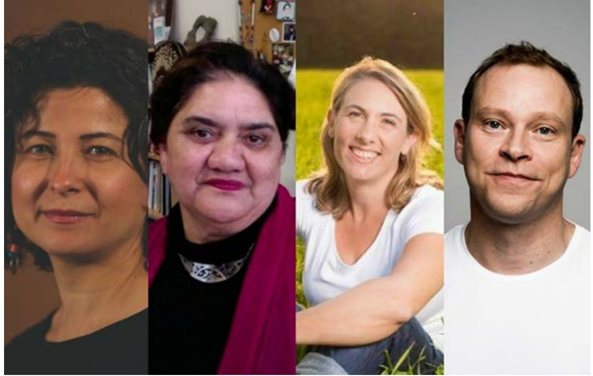
Panellists for #Wheretonow?