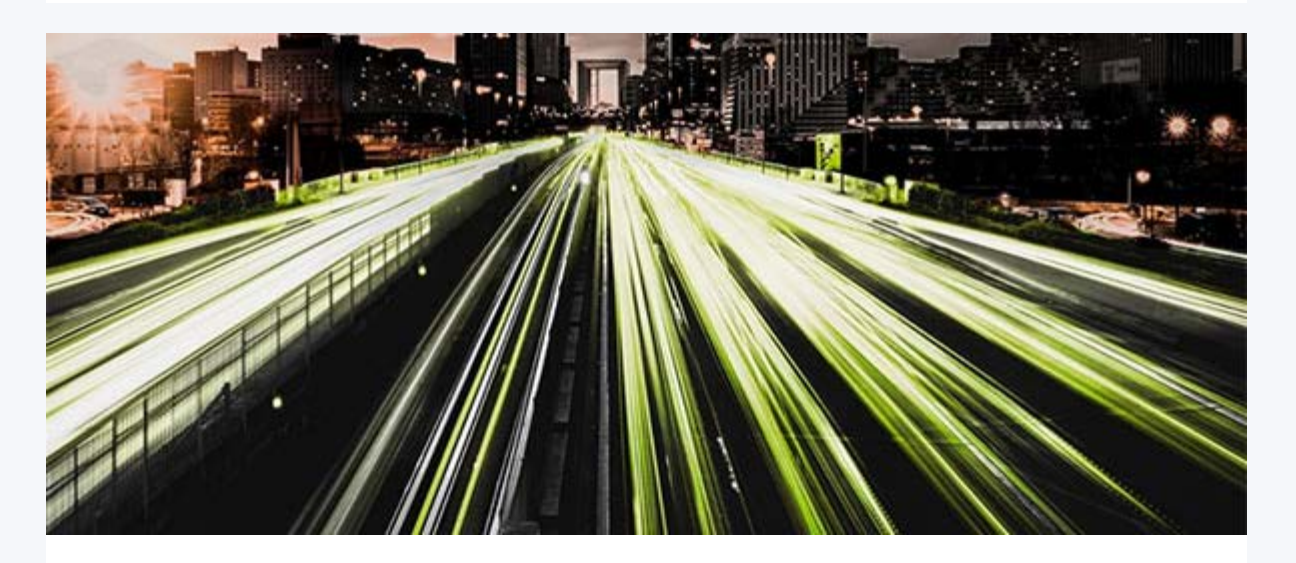
Singapore Reception - 27 June