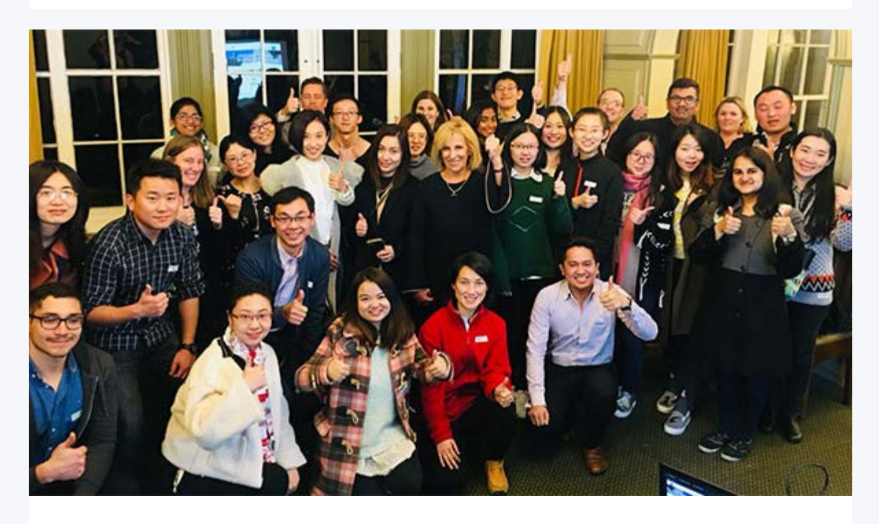
Make a difference in the life of an international student