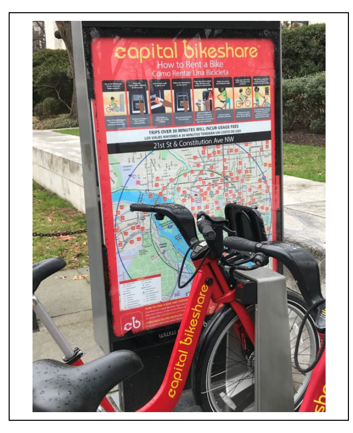
Figure 1. Capital Bikeshare offers a transportation option for visitors and residents to get from Point A to Point B within the District of Columbia where consumers are instructed about how to rent a bicycle.

Journal of Public Policy & Marketing 37(2)