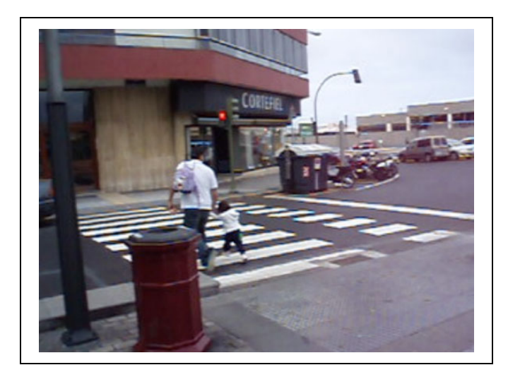
Figure 9. Parent and Child Crossing at a Red Light

suit with car drivers. So, if there is a stop sign, I'll brake; if there is a red traffic light, I'll stop; when I turn, I need to signal. (Doramas)