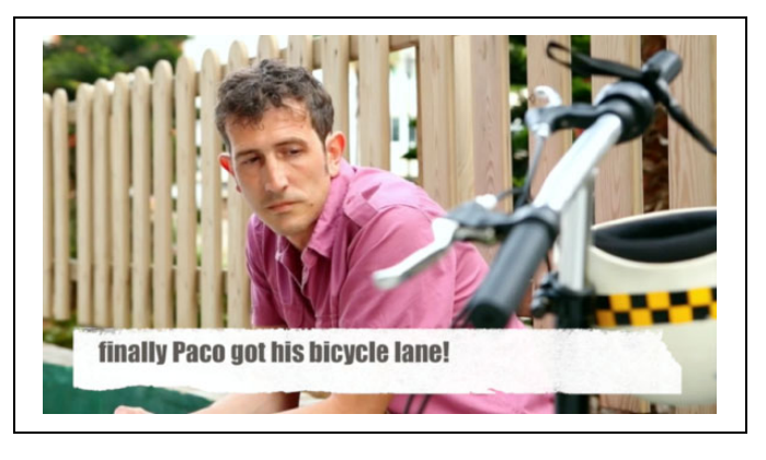
Figure 10. Screenshot from Campaigning Video "Nueva Canarias"

Whereas the previous quotes illustrate the absence of cycling in the city's past, Roberto's quote highlights information about the present. This aspect of time deserves further consideration. Our quotes map out a perpetuation of car driving from the past into the present. While it is widely accepted that most practices