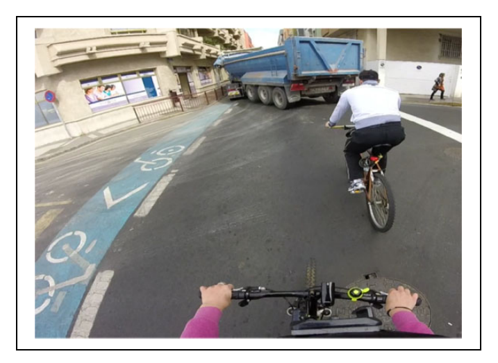
Figure 3. Space Invasion

Contemporary cycling regulations also restrict bicycle parking options. The ordenanza municipal [the municipality regulation] requires bicycles to be parked at a bike rack within a radius of 50 meters from your current location to be reco gidas [in order, tidy] (Ayuntamiento de Las Palmas de Gran Canaria 2015). However, locating these bike racks is extremely difficult, as they are scarce and do not feature in city maps. A second regulation relates to the transport of bikes on buses. Access to buses by bikes is granted only under conditions that are difficult to fulfil. Because Las Palmas does not have any metro or trains, buses are the only available mode of public transport, and thus these restrictions further reduce the likelihood of bike usage.