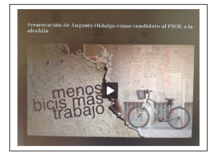
Figure 11. Screenshot from Campaigning Video "PSOE"