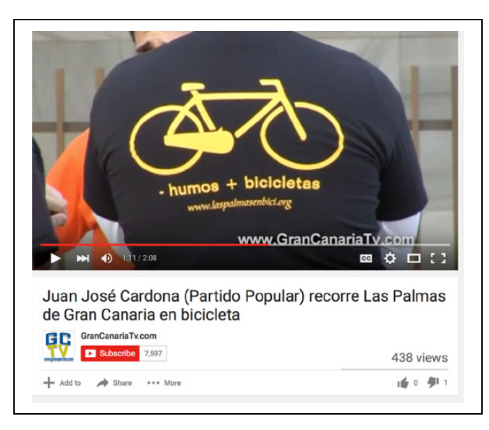
Figure 12. Screenshot from Campaigning Video "Partido Popular"

campaigning practices-winning the election by pleasing different communities. Similarly, at the individual level, the teleoaffective structures of urban moving inject and construct identity because they dictate that being a real isleño [islander] means preferring cars and excluding bicycles for urban transportation. They illustrate how existing meanings associated with car driving and sportive cycling have formed a constituent part of participants' teleoaffective structures since childhood. Teleoaffective structures of these practices shape the practical intelligibility of such practices or "what makes sense to people to do" (Schatzki 2002, p. 81). Consequently, existing practices both teach participants how to move in urban surroundings and organize the subsequent consumption of cars and bicycles for different occasions. As Schatzki (2002, p. 81) frames it, "Activity is governed by practical intelligibility, which is itself determined by mental conditions, many of which are formed during the