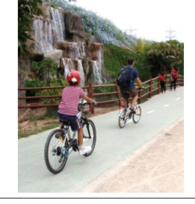
Figure 6. Children Bicycling in the Park