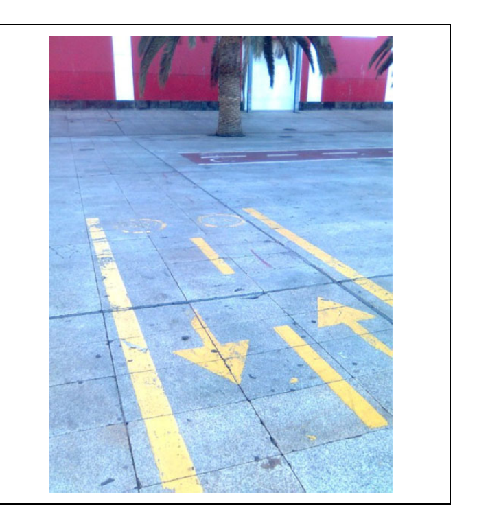
Figure 2. Old Bicycle Lanes

The illogical provision of an abundance of bicycle parking at the beach juxtaposed against a dearth of such facilities in the city center sends a strong implicit message that cycling is not a "serious" mode of urban transportation but is best confined to the sphere of leisure. This combined lack of material arrangements hinders the practice of urban cycling from being anything other than a leisure and sportive activity practiced only in areas distant from city traffic, such as parks and beach promenades (see Figures 5 and 6). The organization of the material environment, then, as Canniford and Shankar (2013) also note, can seriously constrain the development of a practice.