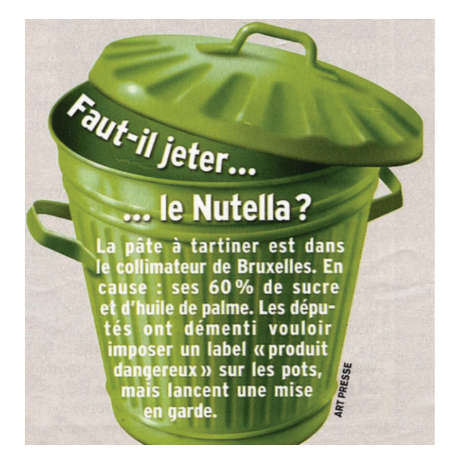
Note: Top to bottom: "Should we throw away ... Nutella? The spread is under the spotlight in Brussels. The reason: its 60% sugar and palm oil content. Representatives deny wanting to impose a "dangerous product" label on the jar, but at the same time issue a warning."

social networks. The discussion quickly spread on the Web. More bloggers were now interested in Nutella and its ingredients, especially those engaged in cooking, environmental, and anti-palm oil issues. Nutella was no longer just one of the many products to avoid amongst others on a long blacklist but entered into anti-palm oil blogger topics. Consumer reactions were differently constituted as societal or individual interiorized tensions and with different targets such as the product, the brand, or the company.