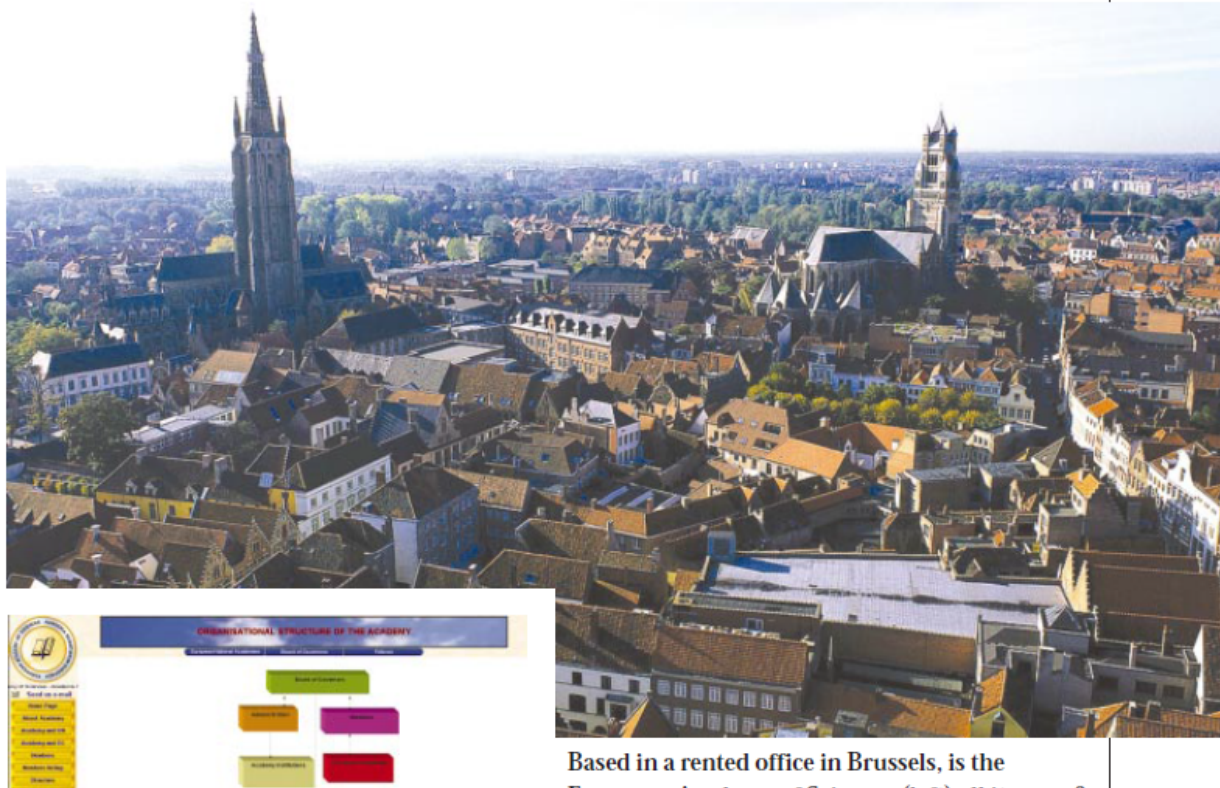
European Academy of Sciences (left) all it seems?

But Nature has been unable to find any record of the academy's publications, projects or meetings, and cannot confirm the scientific credentials of those behind it. The academy, which is not related to the Vienna-based Furnmen Academy of Sciences and Arts