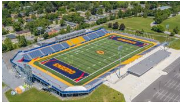
1 - Richardson Stadium

Queen's University is situated on traditional Anishinaabe and Haudenosaunee Territory.