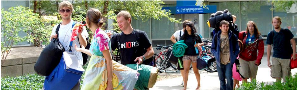
Students move into CWRU North Residential Village