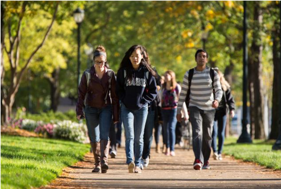
Above: Students walk across Case Western Reserve University campus.

The New Student Checklist ( students.case.edu/checklist ) is designed to help you prepare for your arrival on campus. The Checklist will guide you through all the various tasks required of new students, including selecting housing, meal plan preferences, and registering for classes. In order to begin using the Checklist, you will need to activate your CWRU network ID (instructions are in a separate letter). The Checklist will become available approximately three weeks before the semester starts. Use the following sections of this guidebook to familiarize yourself with your options, then make your selections through the Checklist later.