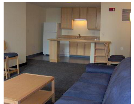
Top (Left to Right): The Village at 116 th ; Pierce Dorm in North Residential Village; The Apartments at 1576 Bottom (Left to Right): Single room in South Residential Village; Common room in the Village at 116; Suite kitchen in the Village at 116 th