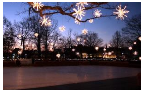
Left: Severance Hall (Top) ; Wade Oval Wednesdays (Bottom)