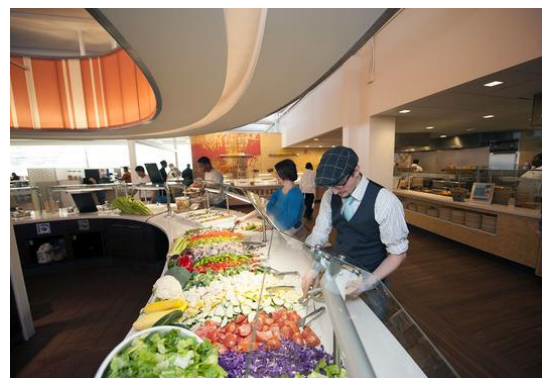
Leutner Dining Hall, North Residential Village