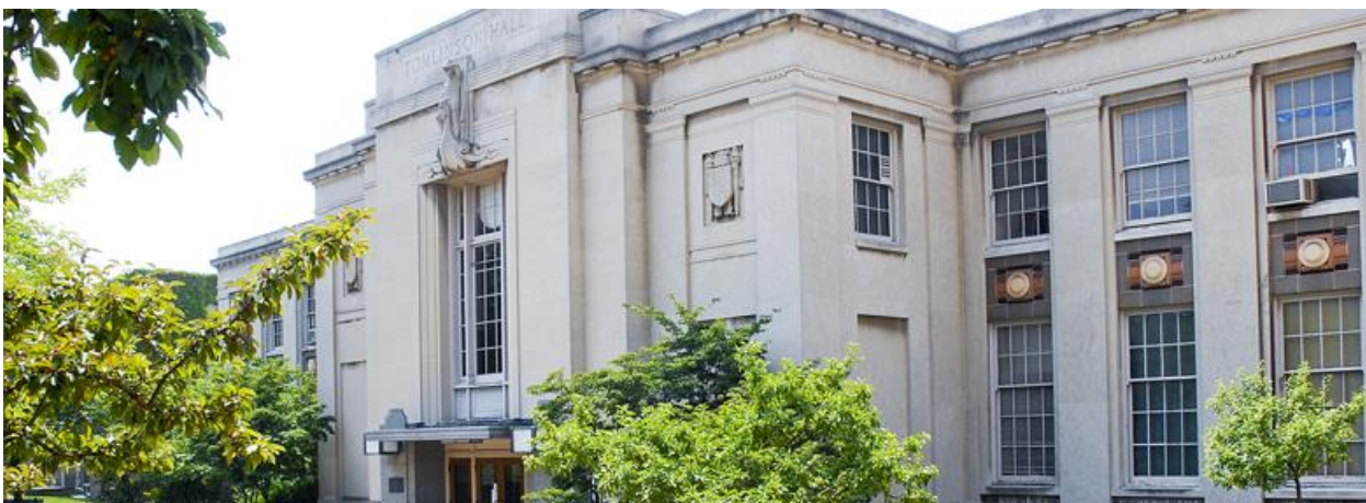
Top Left: Students on DiSanto Field Top Right: CWRU Orientation Leaders Bottom: Center for International Affairs, Tomlinson Hall