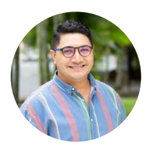
Head of South Auckland Campus

Please feel free to contact us if you're considering the University of Auckland, are already enrolled here, or you just want to find out more about how we can help. Ngā mihi.